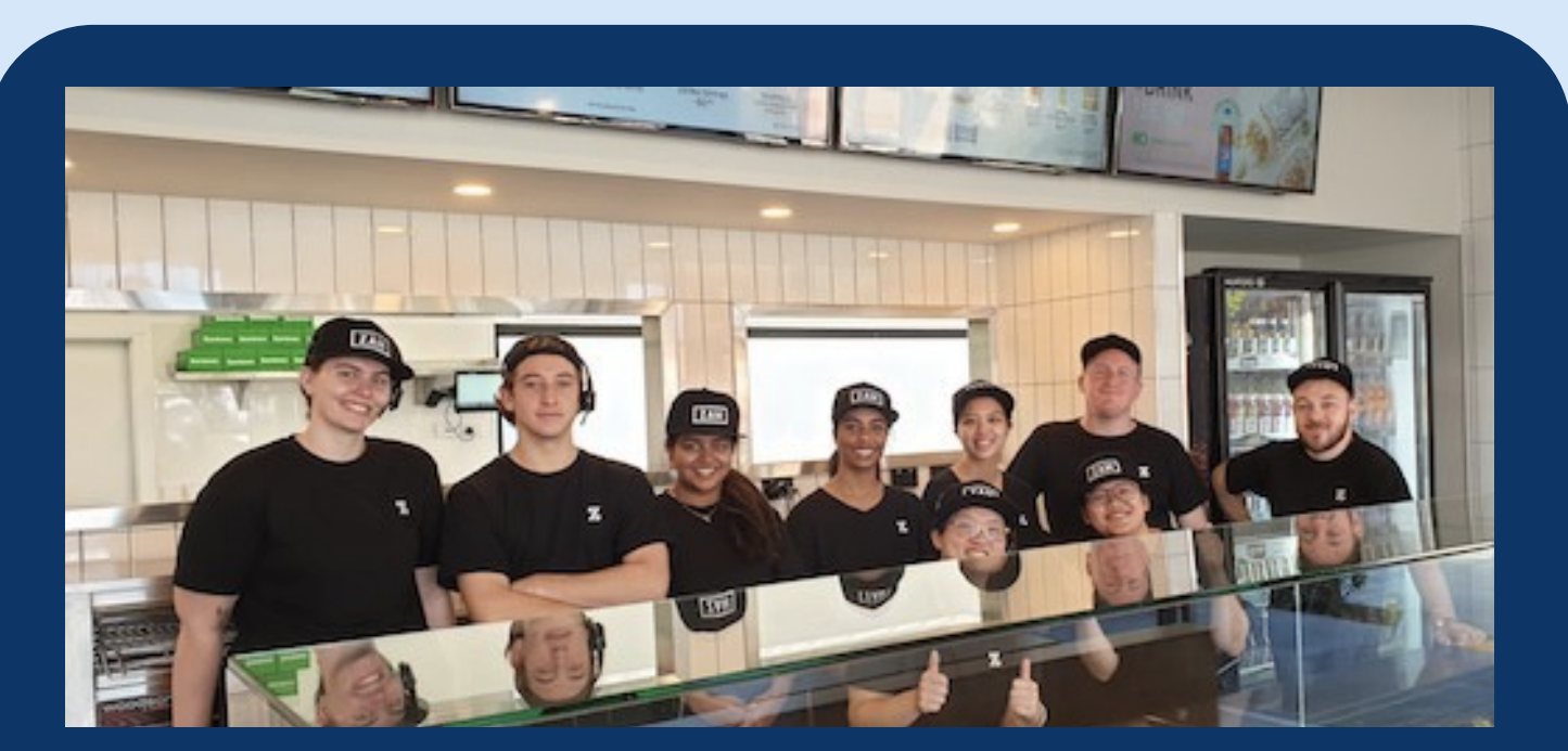
With the incorporation of SpaceDraft, Zambreros can increase productivity and strengthen employee relations.

Have confidence in the productivity and responsibilities of their colleagues.